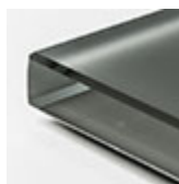
extra clear frosted glass graphite painted