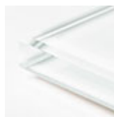
extra clear frosted glass white painted