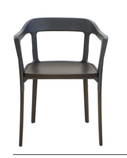
Frame: Anthracite Grey 5142 Seat + Legs: Dark Oak