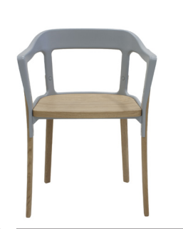
Frame: Grey 5119 Seat + Legs: Natural Oak