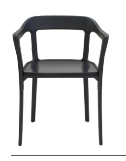
Frame: Anthracite Grey 5142 Seat + Legs: Beech painted Anthracite Grey