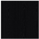
fr73 open pore matt black ashwood