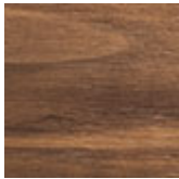
NC walnut canaletto