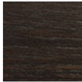
RB burned oak