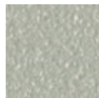
Light grey steel