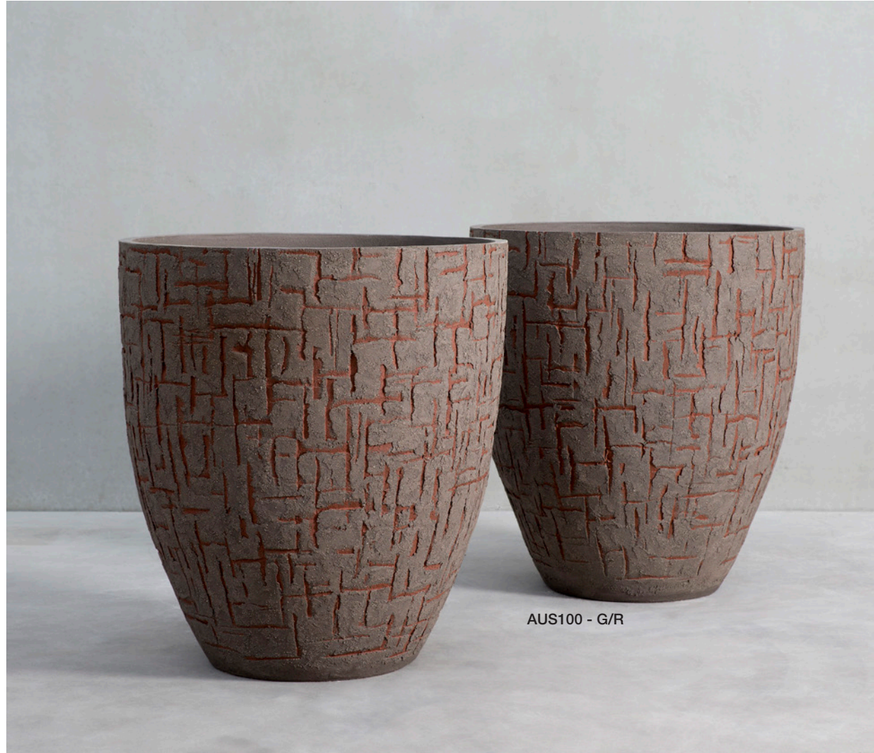
AUS100 - G/R