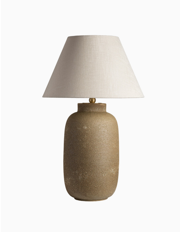
TABLE LAMP | ILANA