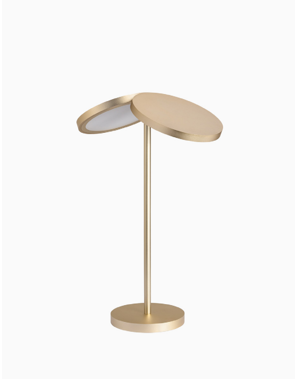
TABLE LIGHT | SAMARA