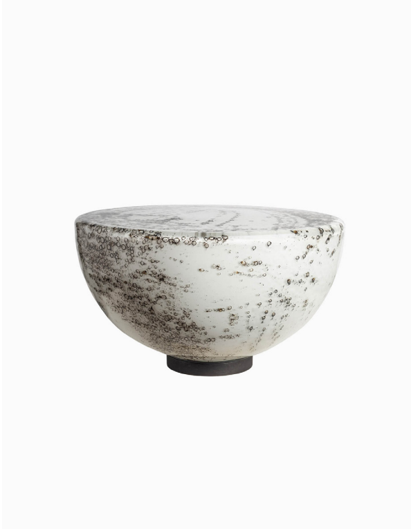
TABLE LAMP | ORLA BRONZE