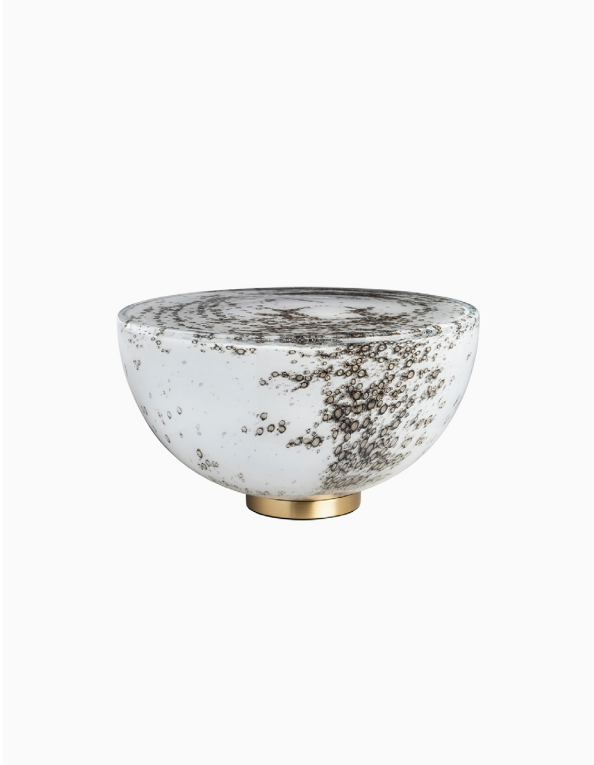
TABLE LAMP | ORLA SATIN BRASS