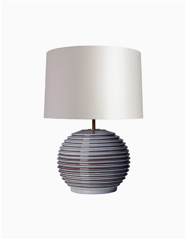
TABLE LAMP | VENICE