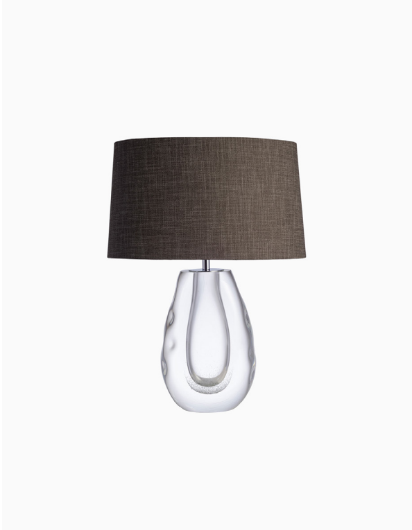
TABLE LAMP | ANYA CLEAR