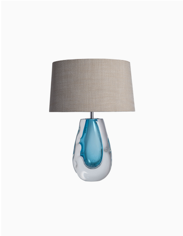
TABLE LAMP | ANYA PEACOCK