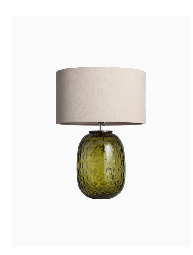
TABLE LAMP | BUBBLE OLIVE