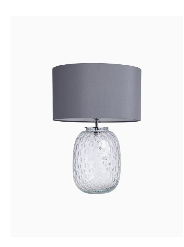
TABLE LAMP | BUBBLE CLEAR