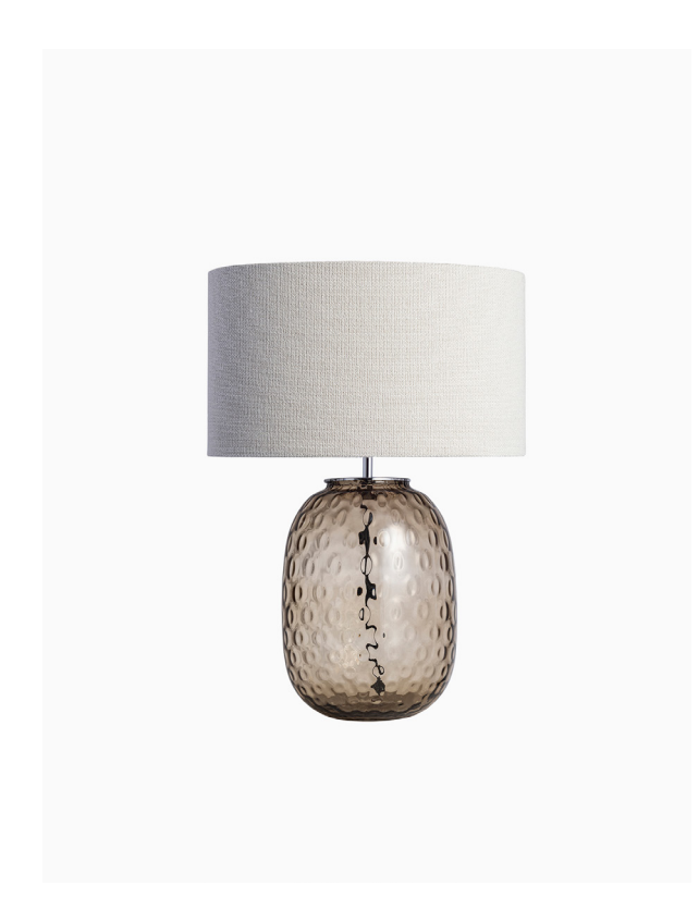
TABLE LAMP | BUBBLE SMOKE