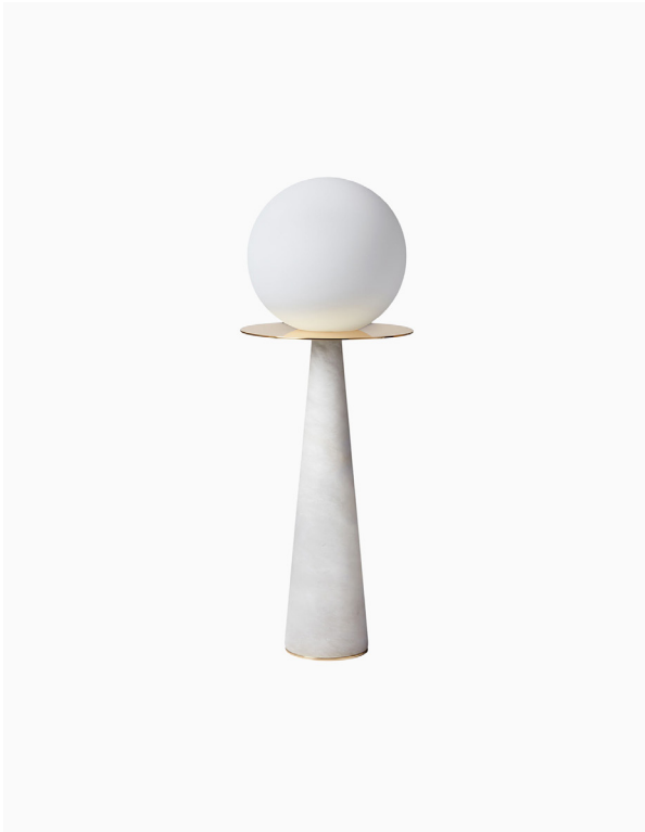
TABLE LAMP | HALO