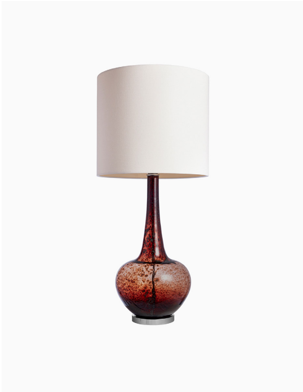
TABLE LAMP | GRACE TUSCAN RED