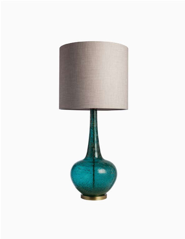
TABLE LAMP | GRACE TUSCAN TEAL