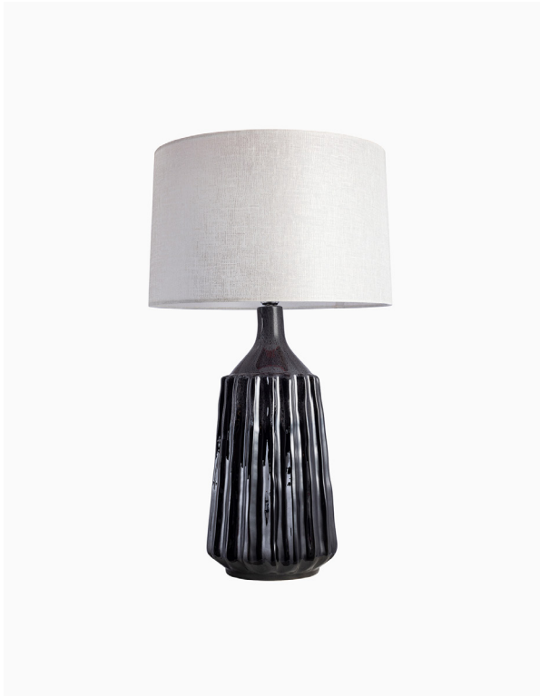
TABLE LAMP | NAPOLI