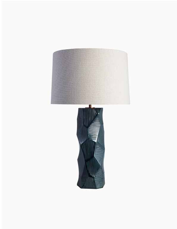
TABLE LAMP | DUNE