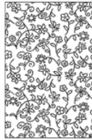
TAFLO4 lana / Wool TAFLO4S seta / Silk