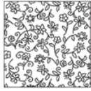
TAFLO1 lana / Wool TAFLO1S seta / Silk