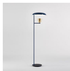
LIGHTOLIGHT P Floor lamp