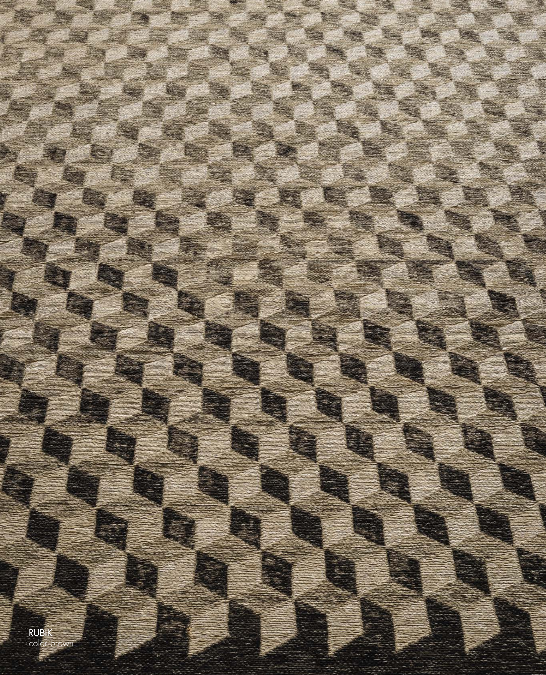
RUBIK color brown