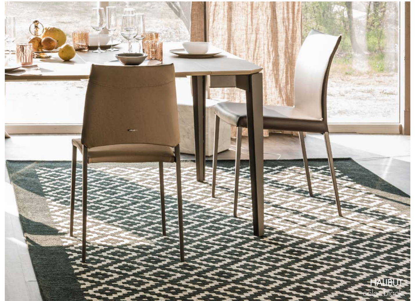
HALIBUT color black