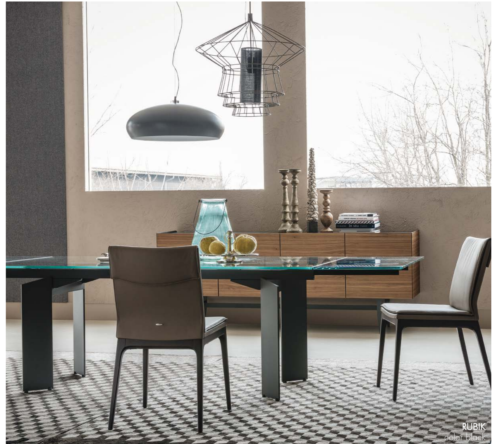
RUBIK color black