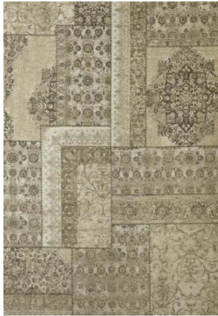
JAIPUR color beige