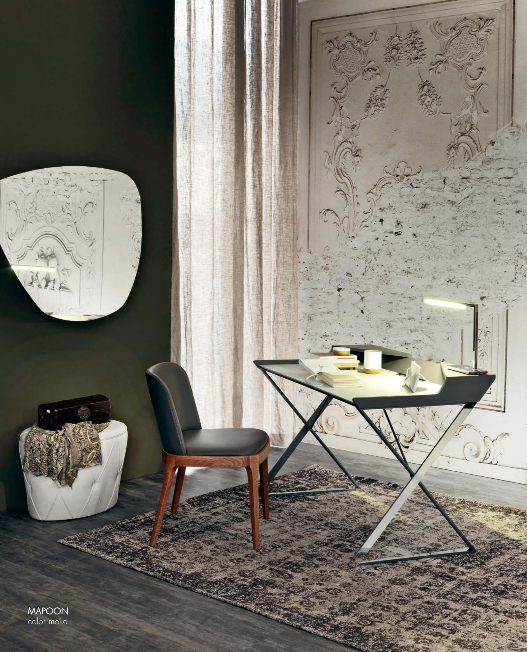
MAPOON color moka