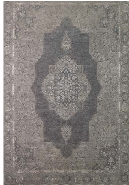
CHENNAI color blue