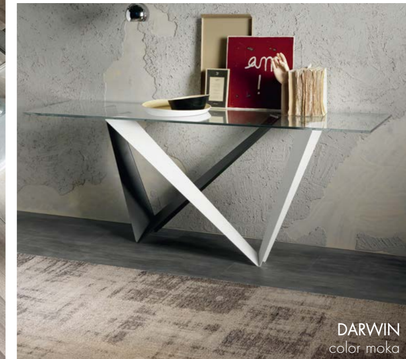
DARWIN color moka