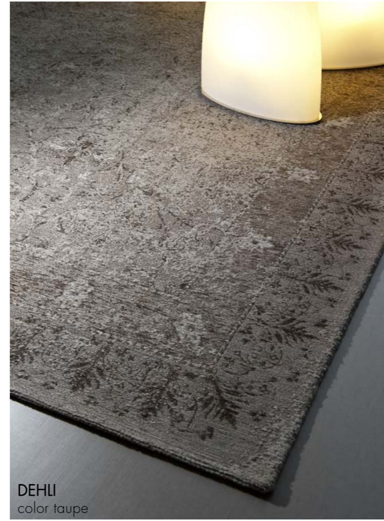
DEHLI color taupe