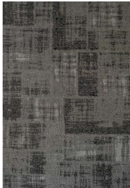
DARWIN color moka