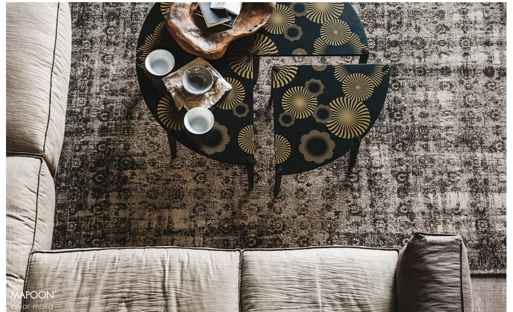
MAPOON color moka