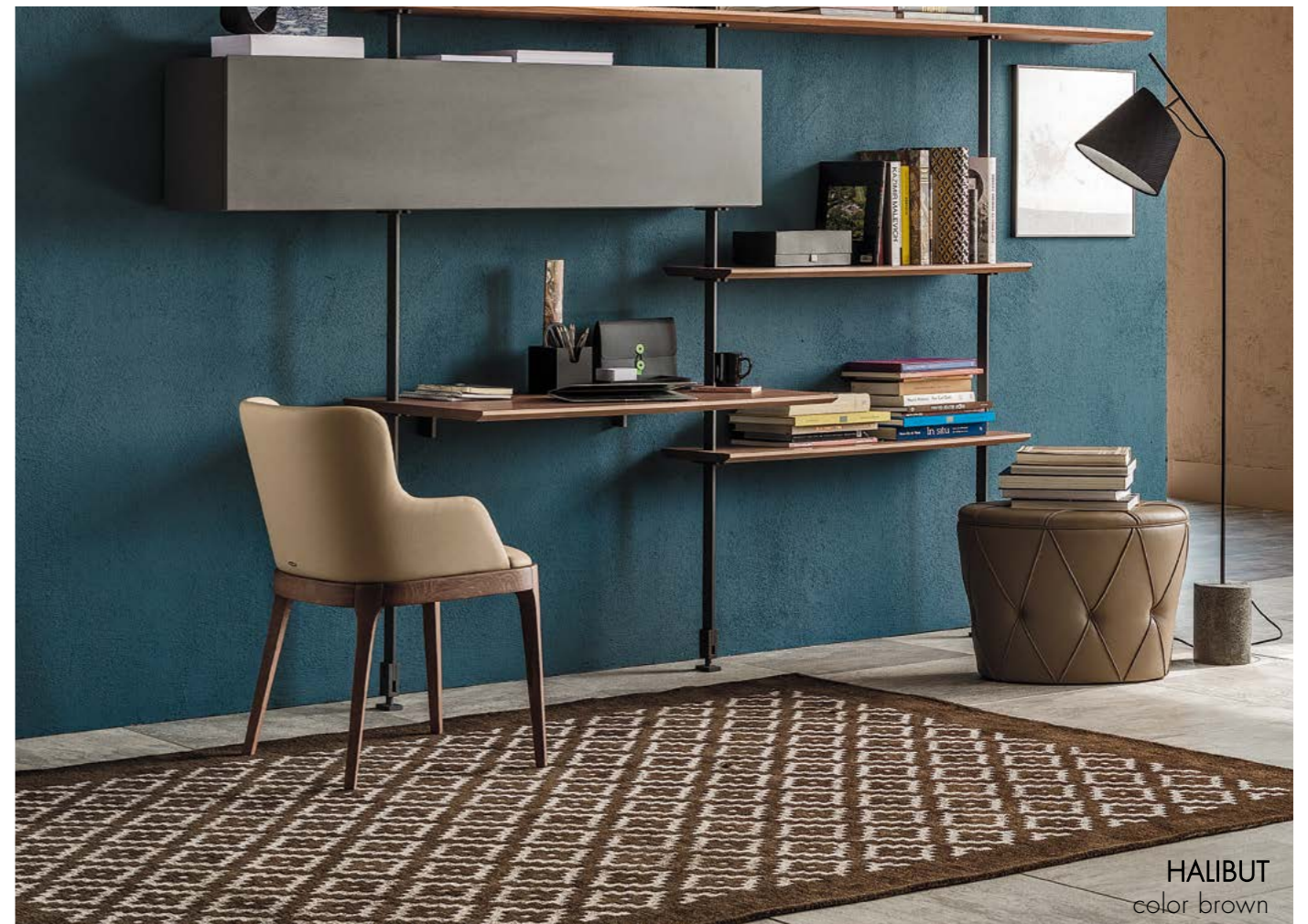
HALIBUT color brown