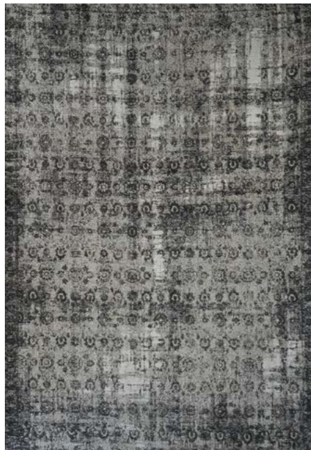
MAPOON color moka