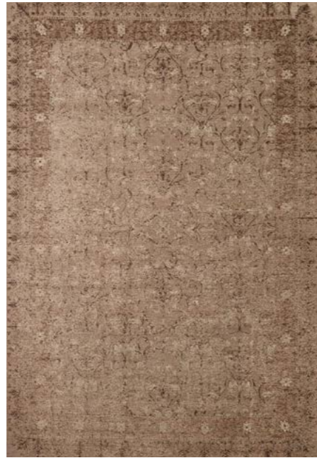
DEHLI color taupe