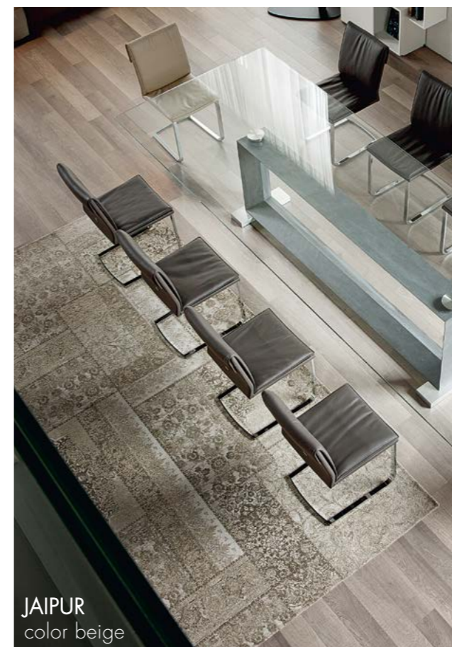
JAIPUR color beige