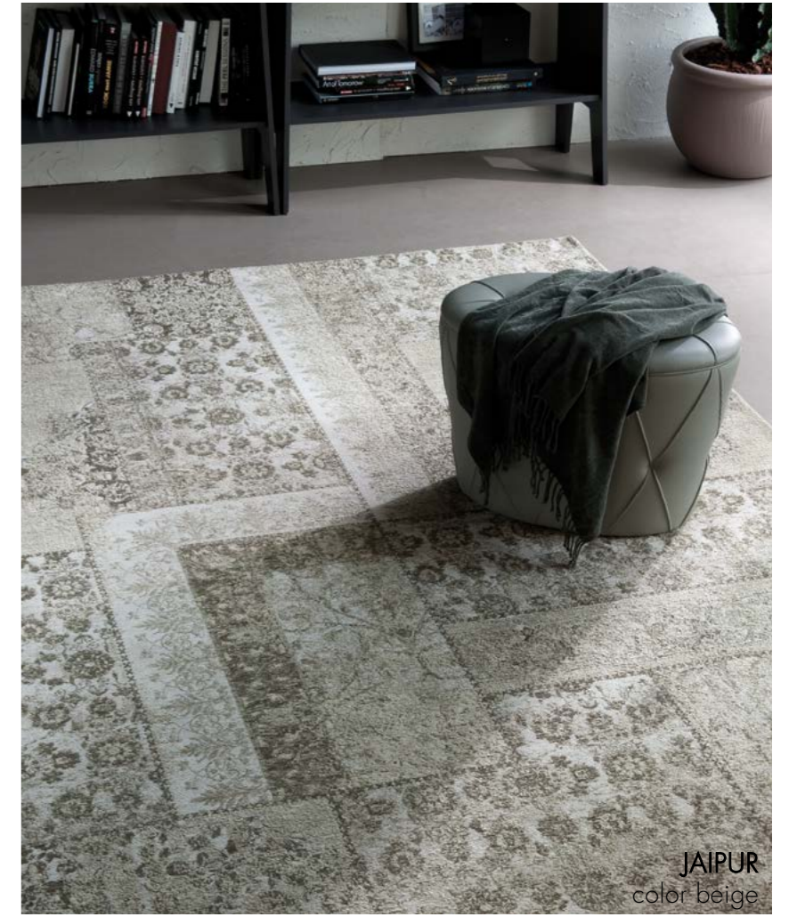
JAIPUR color beige