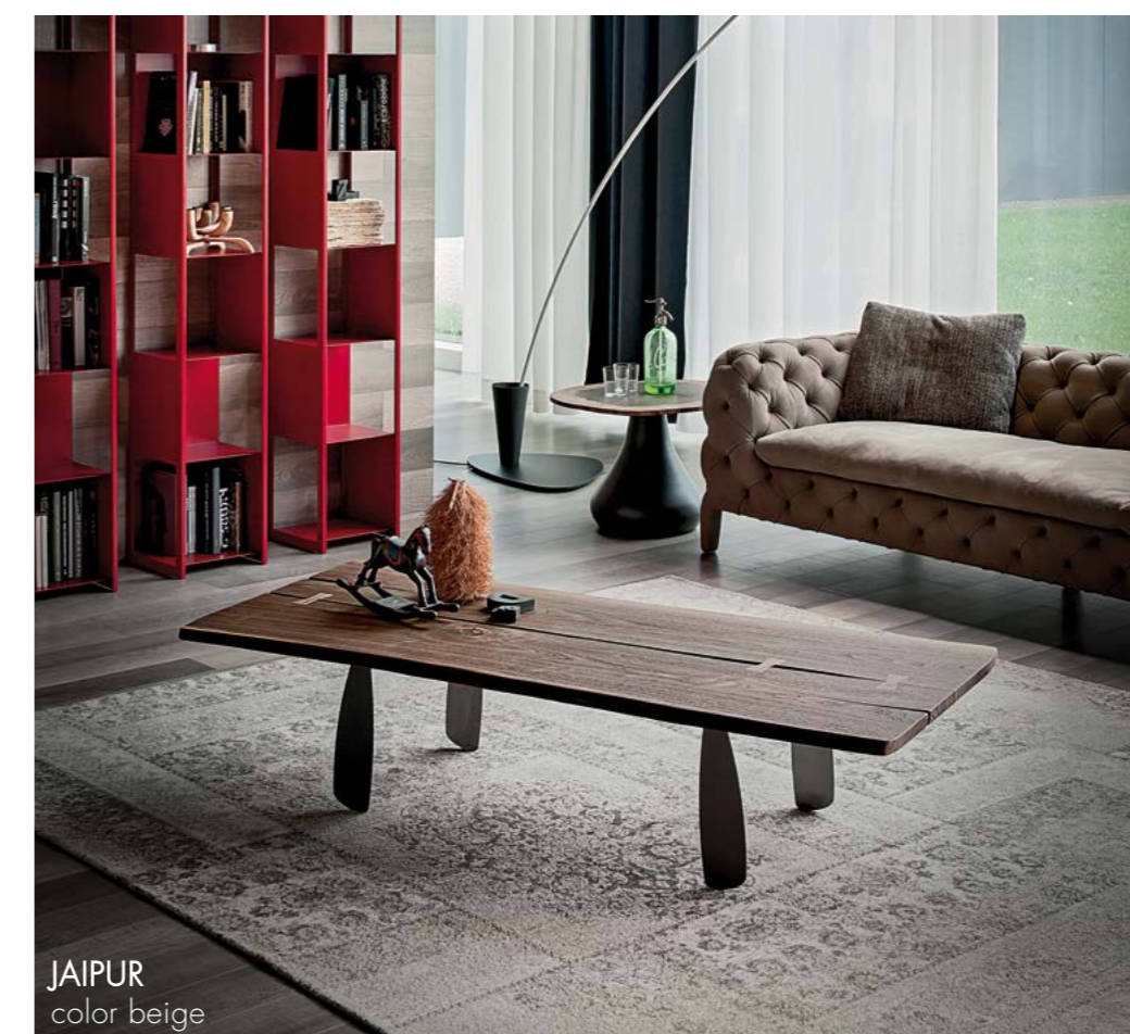
JAIPUR color beige