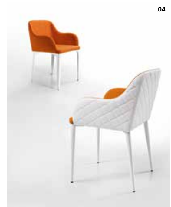
Marilyn S LG, P LG Sedia e poltrona con struttura in legno in diverse finiture. Sedile e schienale imbottiti. - Chair and armchair with wooden frame. Upholstered seat and back. - Chaise, fauteuil et tabouret avec structure en bois en différentes finitions. Assise et dossier revêtus. - Stuhl und Armstuhl mit Holz Gestell. Gespolsterte Sitz und Lehne. - Silla y sillón con estructura en madera en diversos acabados. Asiento y respaldo tapizado. - Стул и кресло с основанием в разных отделках дерева. Сиденье и спинка обитые.