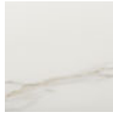
KM05 matt Golden Calacatta