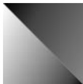
OP17 matt black