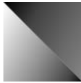
extra clear graphite