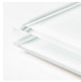
extra clear frosted glass white painted