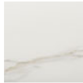
KM05 matt Golden Calacatta