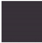
GFM69 graphite embossed