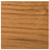
HR Heritage oak