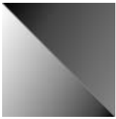
GFM11 titanium embossed