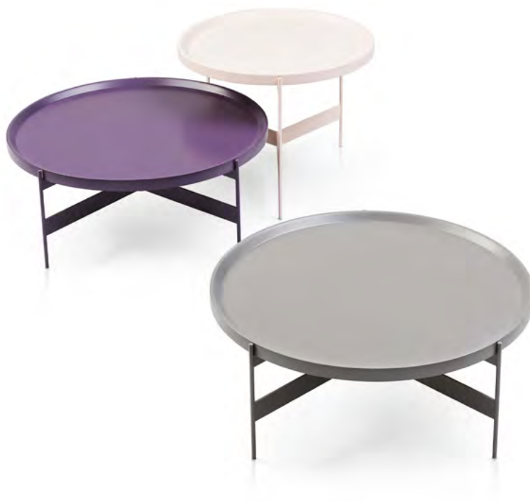
ABACO Coffee table design R&S PIANCA