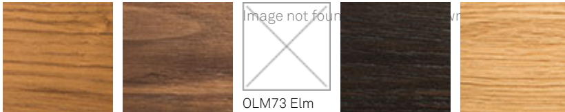
HR Heritage oak