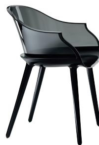
Frame: Glossy Black 1763 C Transparent Smoke Grey 2507 TR