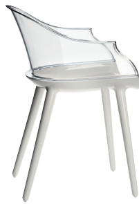
Frame: Glossy White 1736 C Transparent Clear 2540 TR