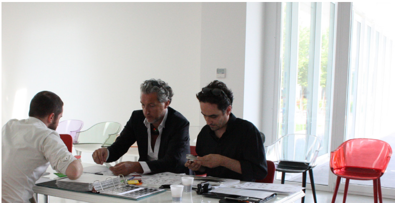
Designer in Magis

of Cyborg, a seat with a highly resistant and versatile polycarbonate shell. The seat can then be completed with backrests in a selection of different natural or synthetic materials: from polycarbonate to wicker, from solid wood to plywood, to the most recent upholstered versions with fabric or leather cover. This further evolution of the chair is in equal parts poetic and technological, cosy and surprising, in keeping with the widest range of different settings.