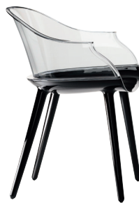
Frame: Glossy Black 1763 C Transparent Clear 2540 TR