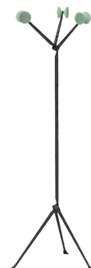
Frame: Black Hooks: Light Green