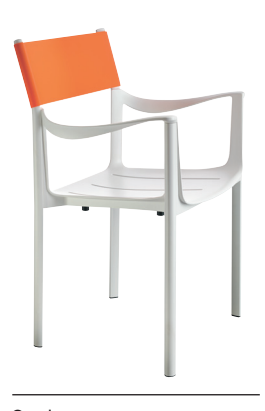
Seat + Frame: White 5110