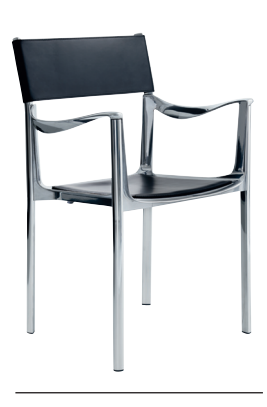
Indoor use Seat + Frame: Polished