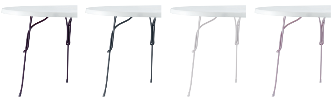
Frame: Purple Violet 5047 Top: White 9000