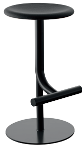
Frame: Black 5130 Seat (Polyurethane): Black 1764 C