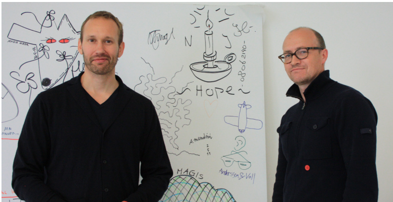
Designers in Magis

colours, to match any taste and setting, at home or in the contract world.