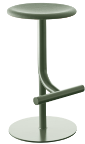
Frame: Light Green 5041 Seat: Light Green F-351 (935)