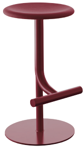
Frame: Bordeaux 5046 Seat: Bordeaux F-128 (615)