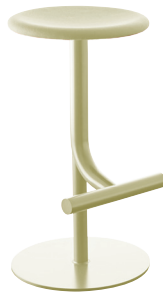
Frame: Lime 5029 Seat: Lime F-577 (435)