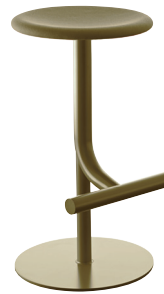
Frame: Olive Green 5039 Seat: Olive Green F-353 (985)