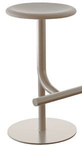
Frame: Beige 5123 Seat: Beige F-742 (240)