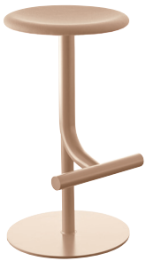
Frame: Beige 5123 Seat (Polyurethane): Beige 1712 C