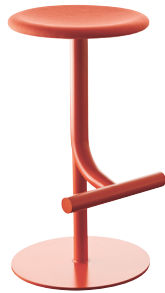
Frame: Coral Red 5084 Seat: Coral Red F-089 (550)