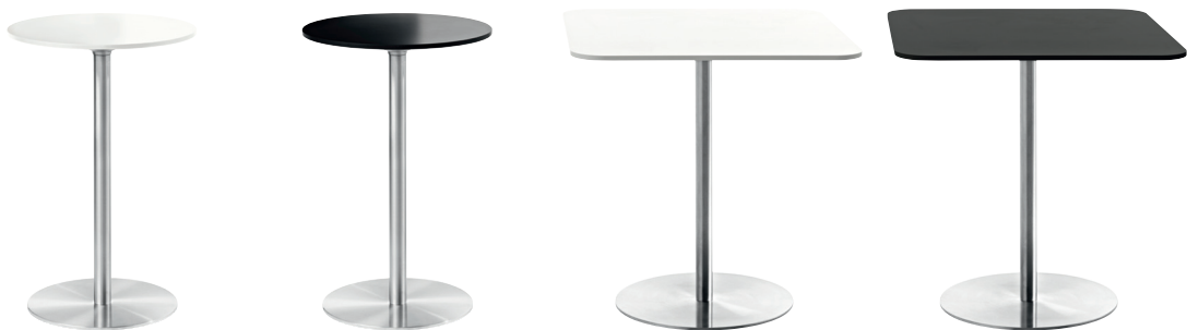
Top Finish White 8500