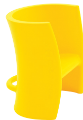
Matt colour Yellow 1665 C