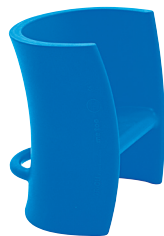
Matt colour Blue 1252 C