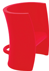
Matt colour Red 1004 C