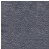
PL73 NERO PERLATO LUCIDO