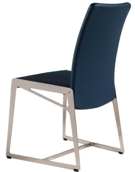
Chaise - Chair - Sedia - Silla