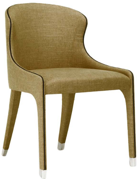
Chaise - Chair - Sedia - Silla - Stuhl