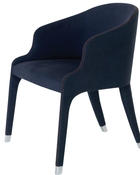
Bridge - Armchair - Poltrona - Sillón - Armlehnstuhl