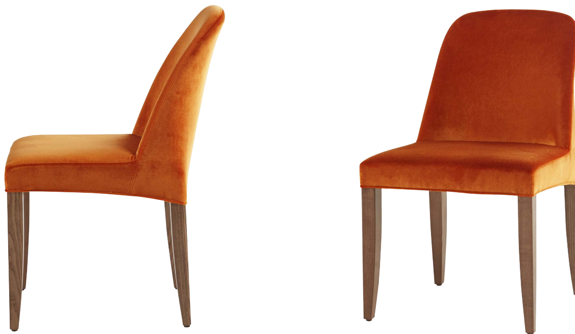
Chaise - Chair - Sedia - Silla - Stuhl