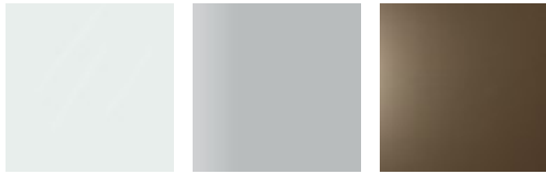
V00 Naturale V05 Fumé V01 Bronzo