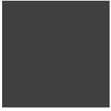
524 Verniciato Canna di fucile