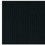
51 Oak Black