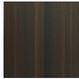
52 Rovere fumé