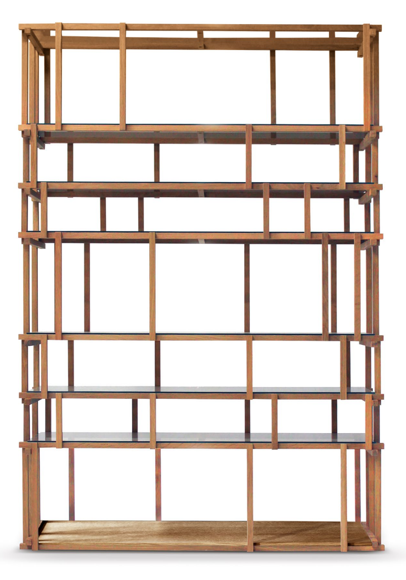
— Off Cut bookshelf with structure in Natural oak

Off Cut bookshelf with structure in Canaletto walnut