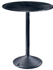
Frame: Anthracite Grey 5142 Top: Black Marquinia Marble