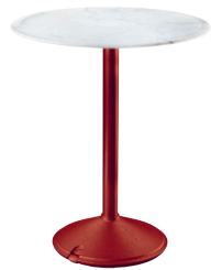
Frame: Red 5143 Top: White Carrara Marble