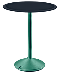
Frame: Green 5126 Top: Black 8510