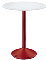
Frame: Red 5143 Top: White 8500