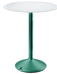
Frame: Green 5126 Top: White 8500