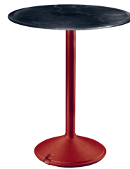
Frame: Red 5143 Top: Black Marquinia Marble