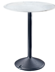
Frame: Anthracite Grey 5142 Top: White Carrara Marble