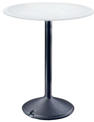
Frame: Anthracite Grey 5142 Top: White 8500