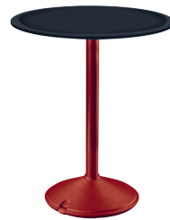
Frame: Red 5143 Top: Black 8510