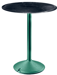
Frame: Green 5126 Top: Black Marquinia Marble