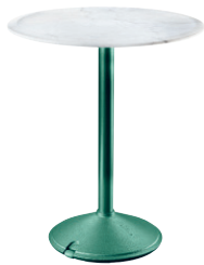
Frame: Green 5126 Top: White Carrara Marble