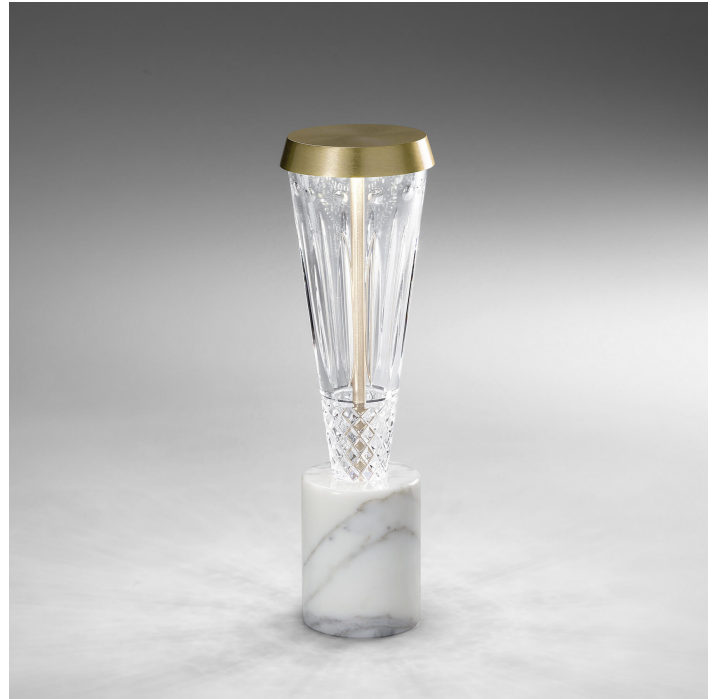
Table lamp in hand-carved crystal and base in gold Calacatta marble. Structure and diffuser in metal with brushed light gold finish.