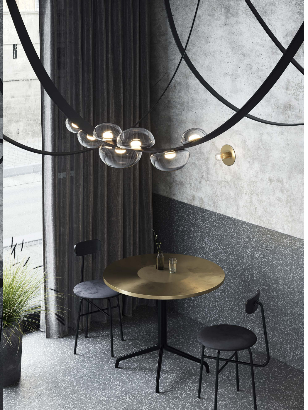
visualization by Monument office