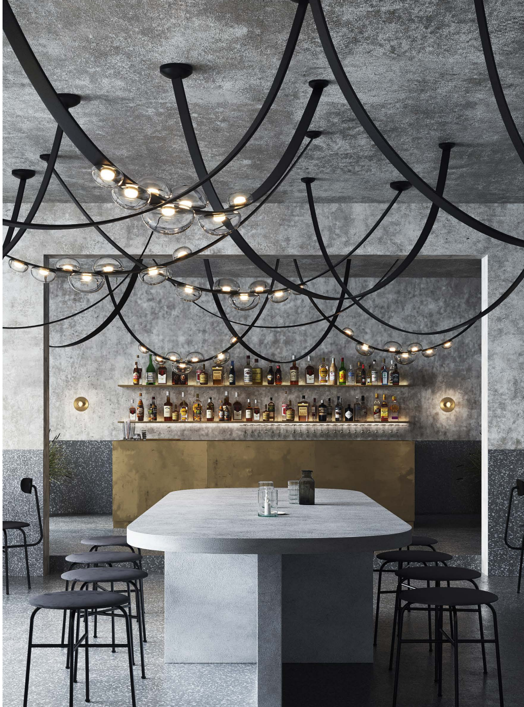
visualization by Monument office