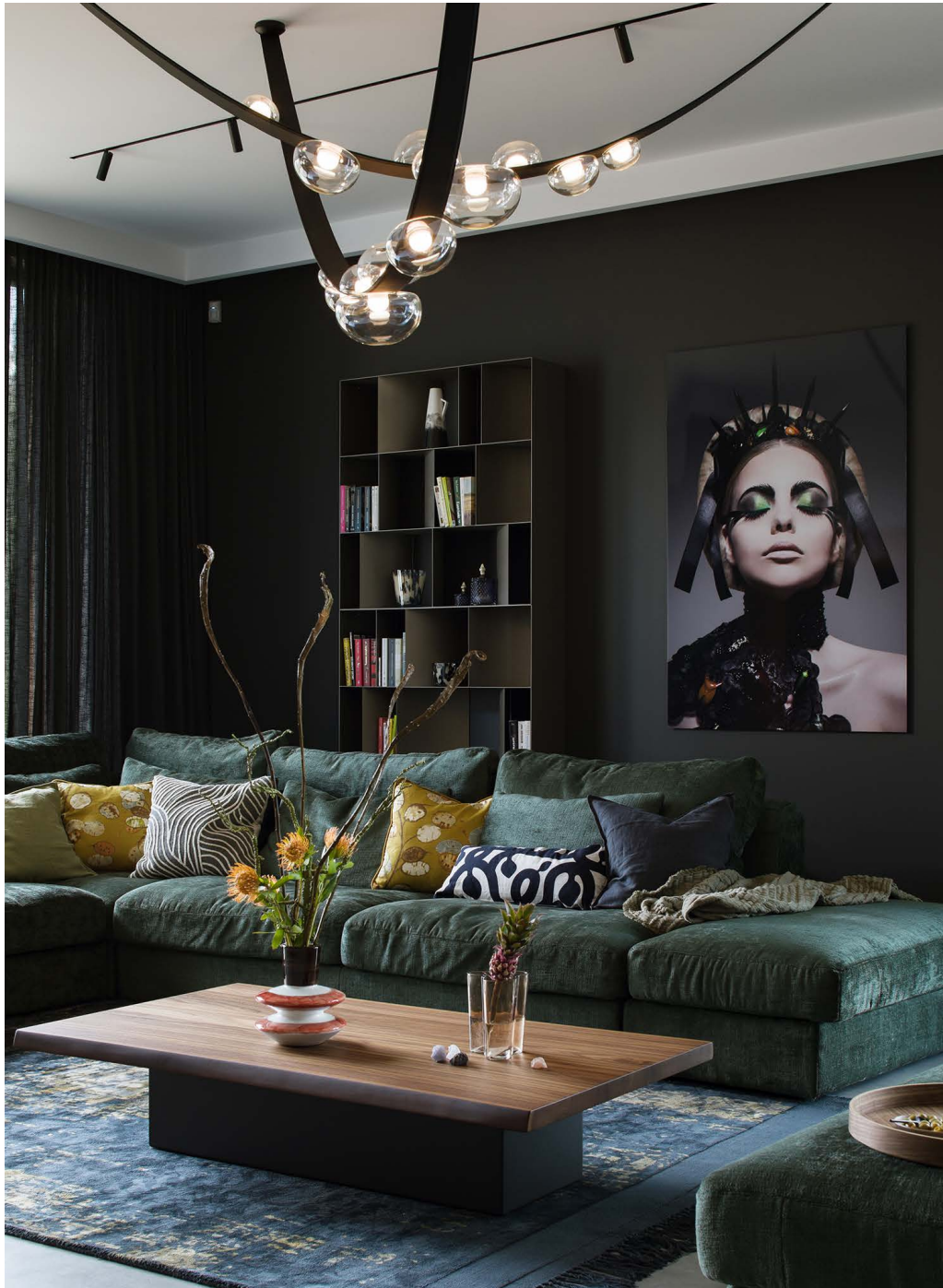
Private residence by MUM Studio, Poland, 2022