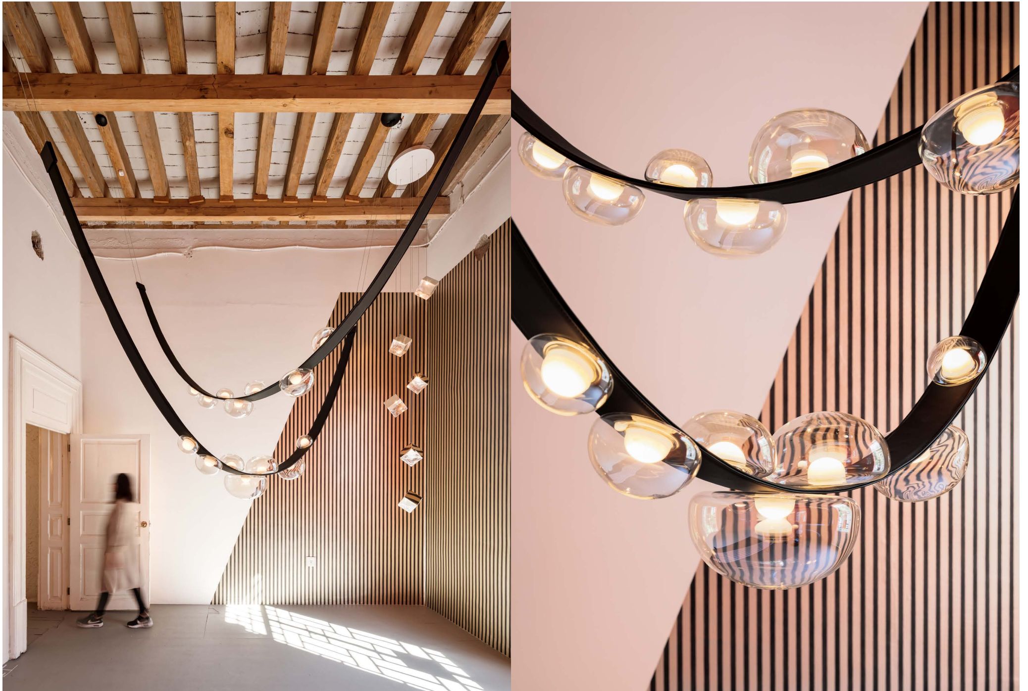
Maison Diez Company, Mexico, 2022