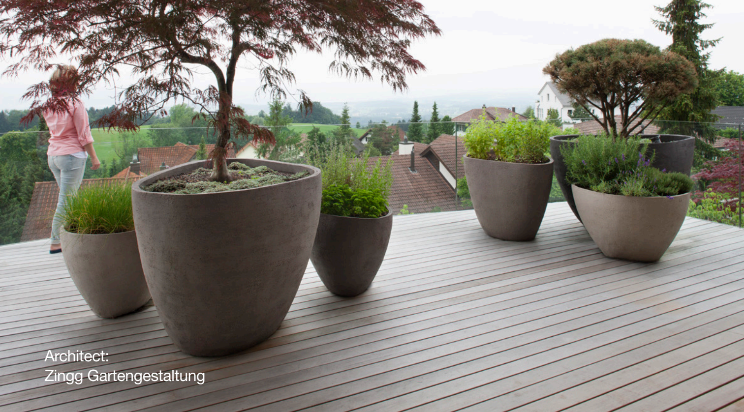
Architect: Zingg Gartengestaltung

View at lake Zurich, Switzerland — When I think back about the time when I was planning the now finished garden in the Zurich Oberland, a quote by Frank Lloyd Wright immediately comes to mind: “Nature provides endless inspiration. Her riches are greater than any human can long for.” Fundamentally, nature and architecture are actually contrasts - each house and each garden is an interloper - however much it tries to adapt to its environment. So during the process of design, I always feel responsible for connecting humans, nature and garden architecture and for creating softly fluid transitions to the various living spaces. This means creating from the outset a harmonious whole including the house and garden with personality, proportions, materialisation and colour concepts.