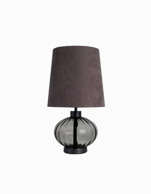
TABLE LAMP | PEDRA SLATE