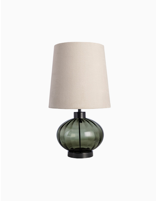
TABLE LAMP | PEDRA MOSS