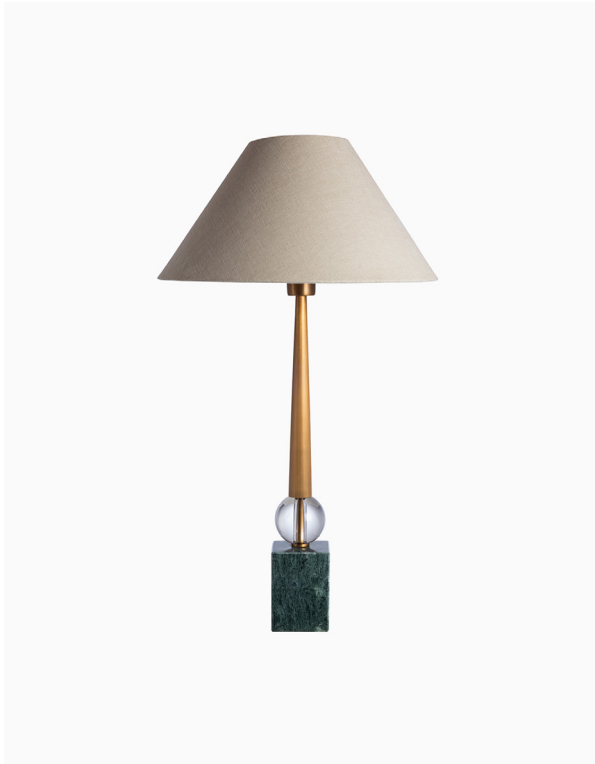
TABLE LAMP | TIVOLI VERDE