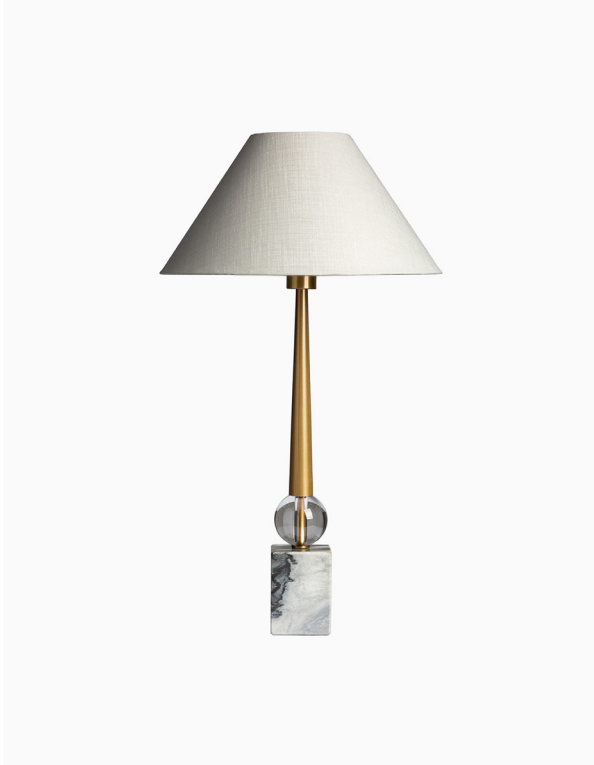
TABLE LAMP | TIVOLI ASH