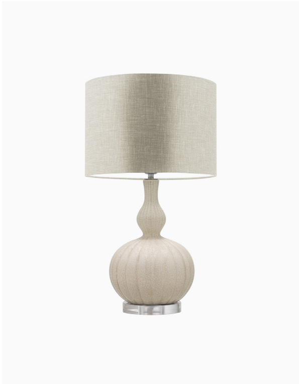
TABLE LAMP | CELINE