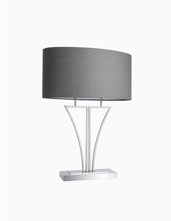
TABLE LAMP | YVES NICKEL