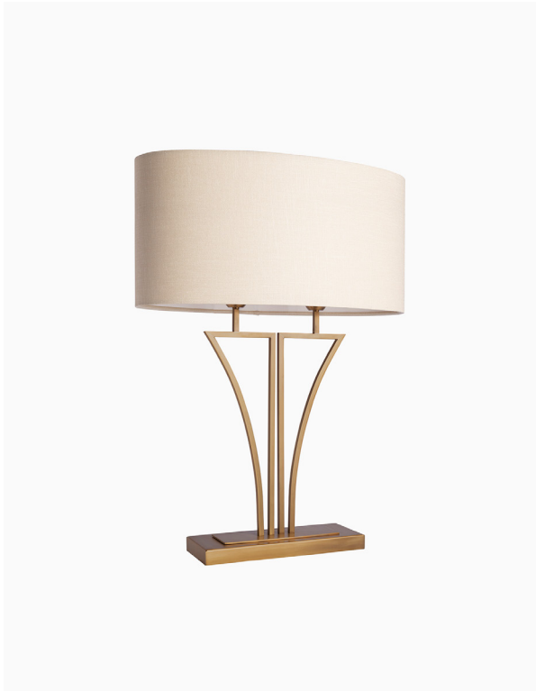
TABLE LAMP | YVES ANTIQUE BRASS