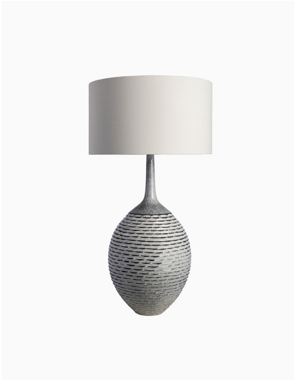
TABLE LAMP | PIERRE