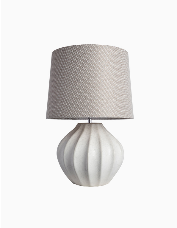
TABLE LAMP | FRAGA